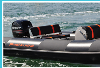
Aft bench seat